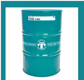
54-gallon drum SKU: C380/54 UPC-12: 641238066163