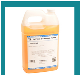
1-gallon jug SKU: C380/1 UPC-12: 641238066194