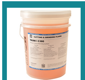
5-gallon pail SKU: C380/5 UPC-12: 641238066170