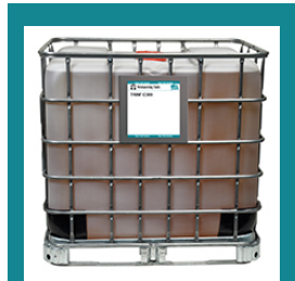
270-gallon tote SKU: C380/NR270P UPC-12: 641238066187